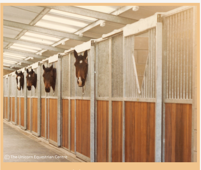
Pristine stables to guarantee your horse's comfort and safety