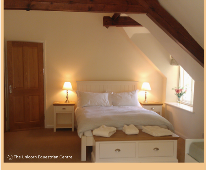
Enjoy the convenience of optional comfortable accommodation

Please note: Dogs are only welcome if they are kept on a lead. They are not allowed in any of the buildings including accommodation. They MUST sleep in your vehicle.